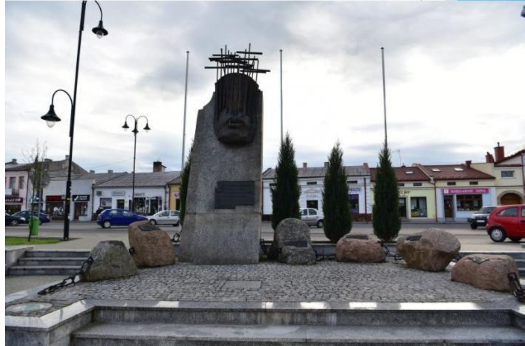
The Monument of Soldiers and Heroes